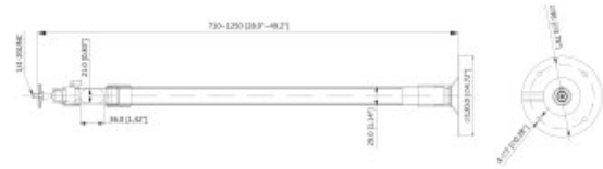
Alle Angaben in mm [inch] Irrtum und technische Änderungen vorbehalten