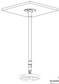
Beispiel / Example Auslieferung ohne Kamera Shipment without camera